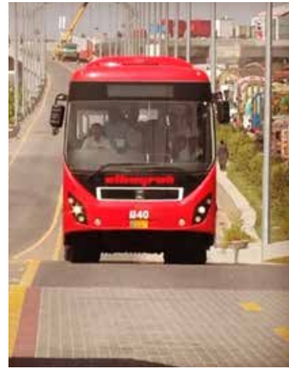
Metro Bus Station 1 min drive