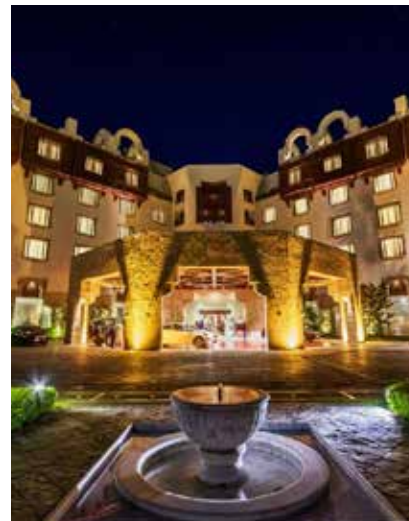
Islamabad Serena Hotel 25 min drive (Signal Free)