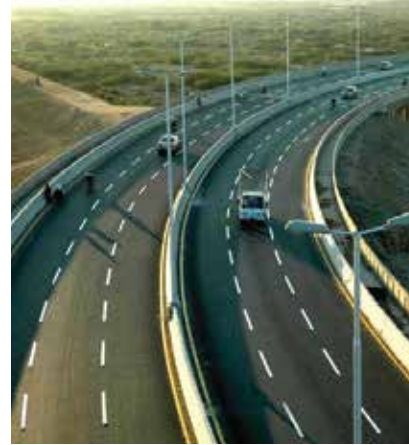
M1-M2 Motorway 5 min drive