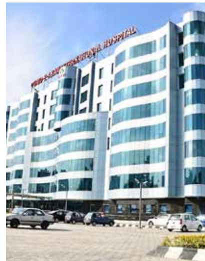
Quaid e Azam Hospital 15 min drive