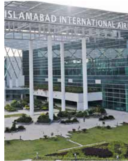
Islamabad International Airport 5 min drive