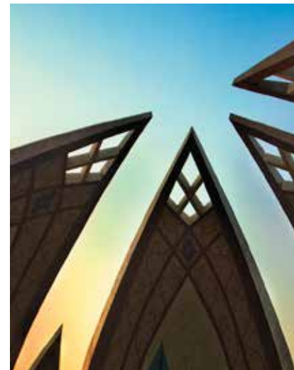
Zero Pont Islamabad 15 min drive